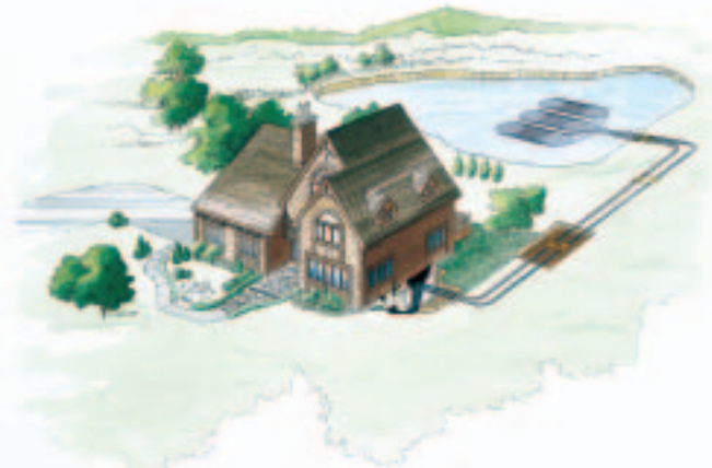
Pond Loops: Coils of pipe are fabricated and sunk to the bottom of the pond.