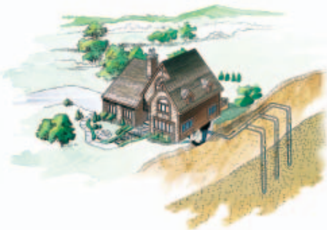
Vertical Loops: Used where land area is limited or soil conditions prohibit horizontal loops. Installed using a drilling rig.