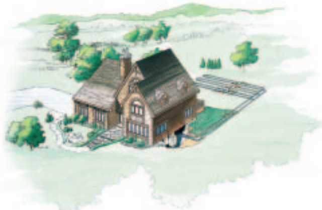
Horizontal Loops: Used on larger lots. Installed using a backhoe or trencher.

Geothermal systems can be installed with a variety of loop system configurations. "Closed loops" use re-circulated fluid in a series of pipes installed vertically, horizontally, or in a pond. "Open loops" use well water. Your dealer will determine which design works best for your home.