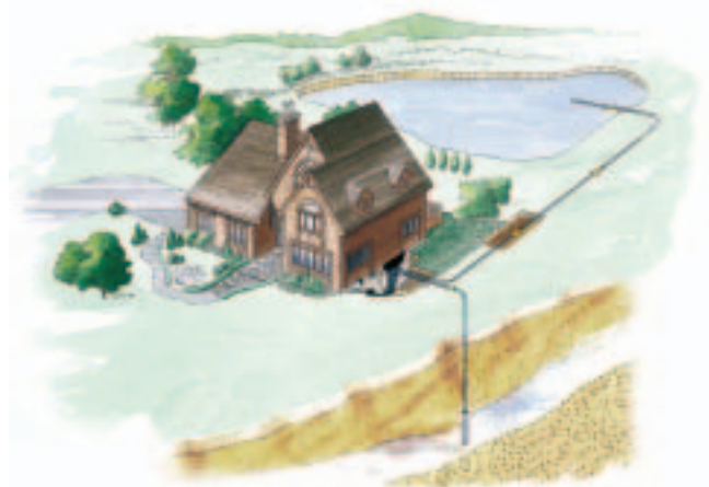
Open Loop: Well water from an existing well can be used, then discharged into a drainage ditch or pond.